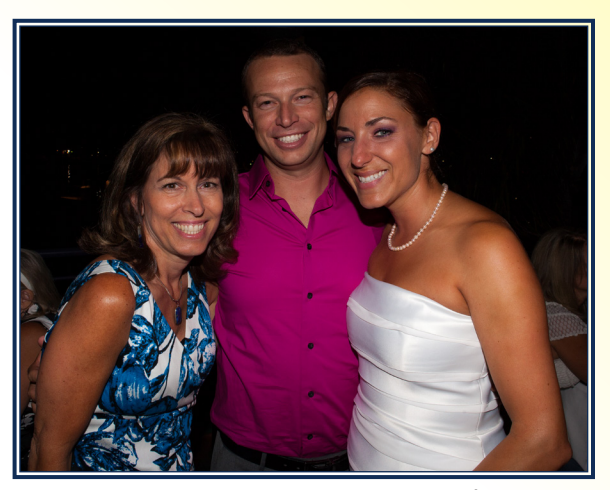
RFNL September 2012 Page 2